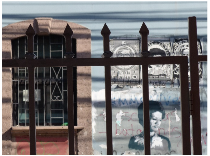
In the streets of Tegucigalpa, 2016.

The joint learning process on civil society's scope for action in Honduras was launched in Honduras in 2015 by Peace Watch Switzerland, HEKS, and KOFF with support from four other Swiss NGOs and the Swiss Agency for Development and Cooperation (SDC). In many ways, it shows how difficult and complex the conditions are for Honduran civil society and its international partners working locally.