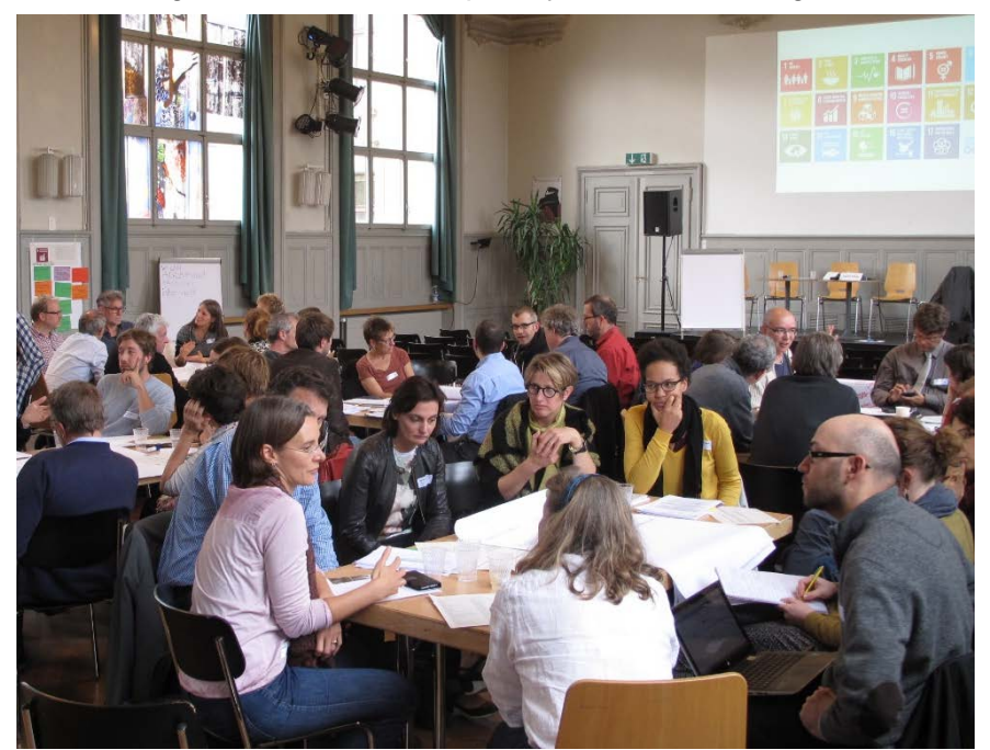
Members of Swiss civil society discuss their role in implementing the Agenda. Alliance Sud

The 50 organizations taking part expressed clear support for greater cooperation. Firstly, they spoke out in favor of finding a common language within Swiss civil society and coming to an understanding despite their various roles and viewpoints on sustainable development goals (SDGs). Secondly, they supported the development of an effective role for monitoring government agencies that is as independent as possible. Participants also criticized the fact that the 2030 Agenda has too low a priority in the minds of government agencies and in Swiss policy