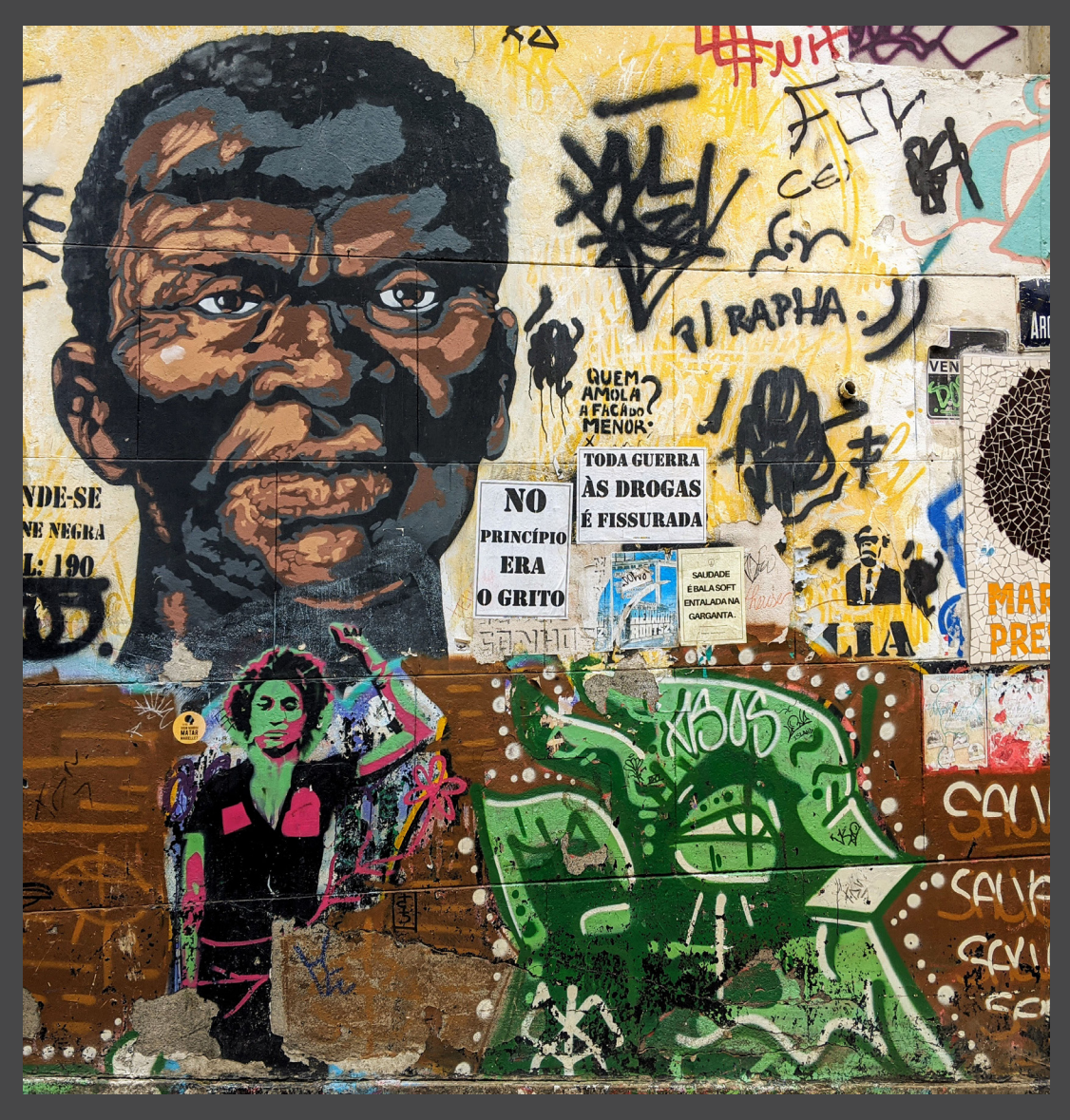
Picture: «Street art, Pedra do Sal, Rio de Janeiro» (CC BY-NC 2.0) by Second-Half Travels (croped from original)

Text by Andrea Zellhuber, terre des hommes schweiz