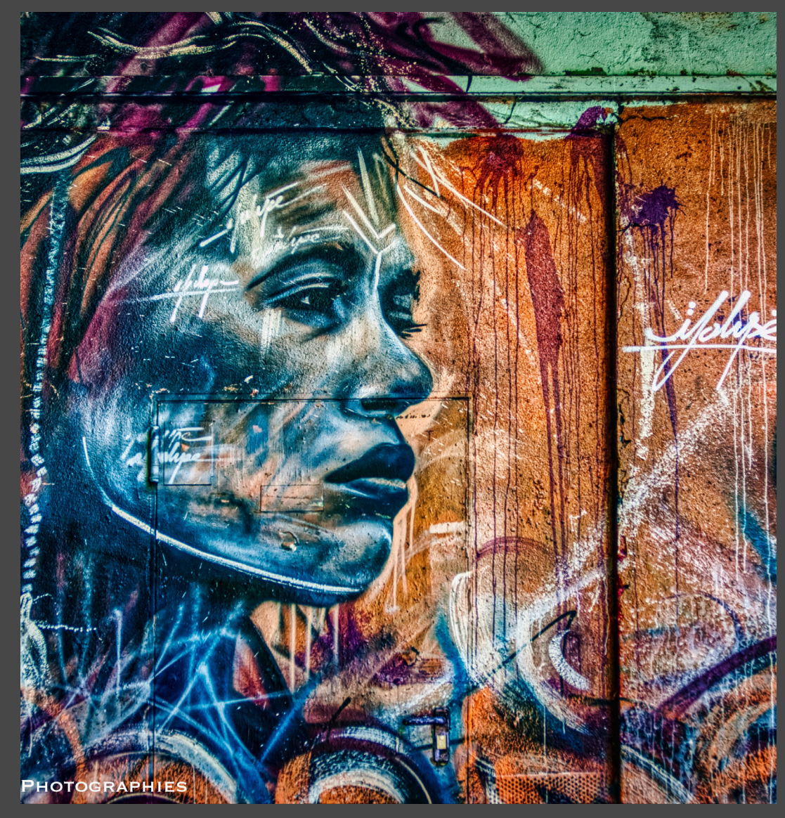
Text by Yasmine Janah, KOFF/swisspeace and Carla Weymann, Peace Women Accross the Globe

Only a few weeks after its co-chairship draws to a close, Switzerland sits now for the first time on the UN Security Council, opening a window for civil society to support Switzerland in solidifying the WPS agenda as a cross-cutting agenda among the Council's 15 members.