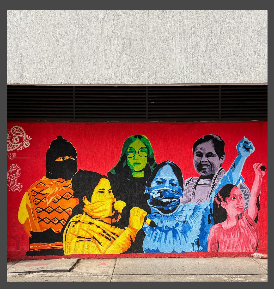
Picture: Street art of Ciudad de México residents.