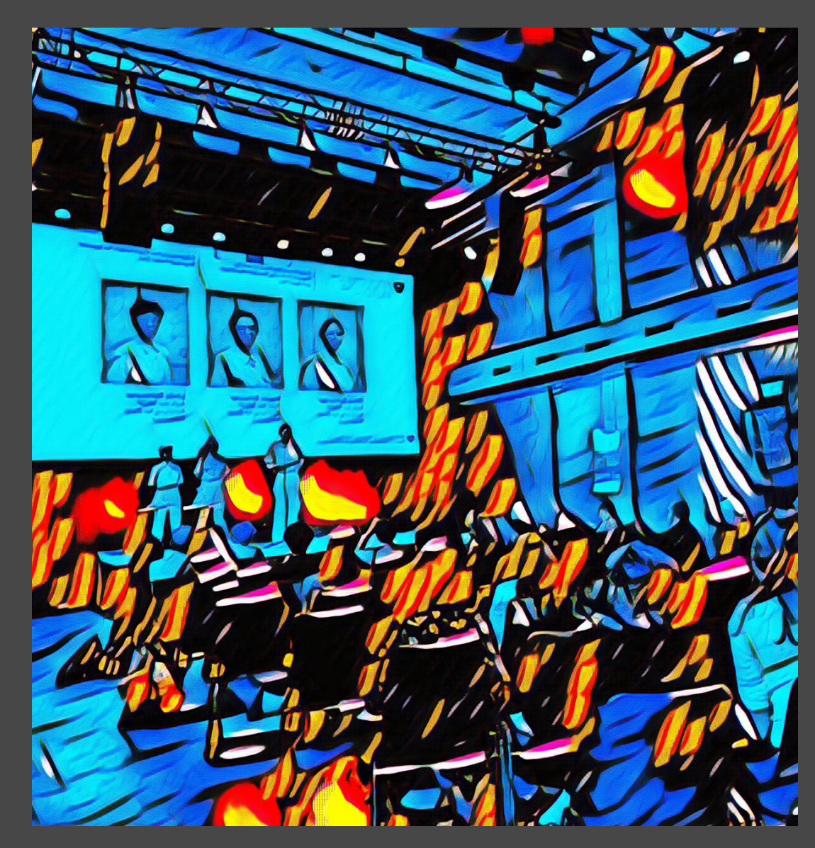
Picture: Drawing based on a photo of the KOFF peace conference in September 2022 Text by Dorothea Schiewer, KOFF/swisspeace and Olivia Schneider, Politesse Publique